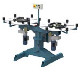
ALO 831 Double coiler