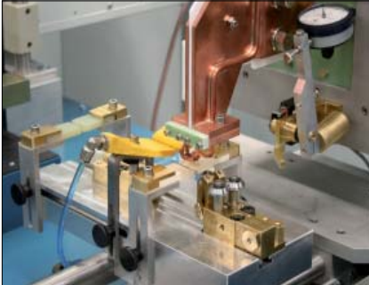
Tooth hardening inductor with air quench

The band feeder consists of two units, one 4-wheel feed unit, the other as an adjustable brake to control the band tension by using a electro magnetic friction brake. Both units are equipped with two pairs of inclined rolls. The four rolls on the feed unit are driven by a servomotor, and the speed is controlled by a servo controller. The oscillating circuits with the inductors are located between the brake and the feed units such that the band is pulled through the inductors at a controlled tension