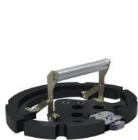
ALO 90915/16/17/18 Collapsible coil center