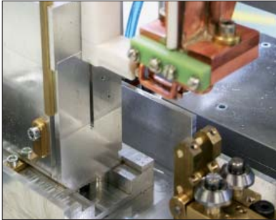
Tooth hardening generator