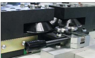
Pinch roller straightening unit