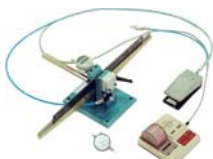
ALO 81-57 Table top set gauge