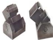
ALO 61201 Grinding fixture