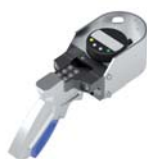
ALO 81-60 Set gauge