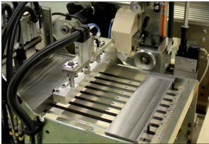
Infeed magazine ready to fill up the batch with a new blade package.