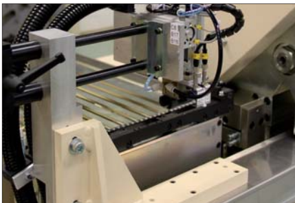
Outfeed magazine with pick and place unit.