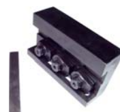
ALO 61207 Grinding fixture