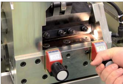
Improved clamping together with digital micrometer makes clamping adjustments easier.