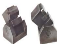
ALO 61201 Grinding fixture