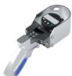
ALO 81-60 Set gauge