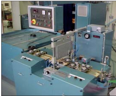
Hardening unit and looptable