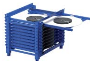
ALO 106 CUBE Coil handling system