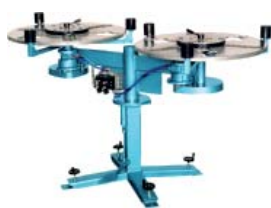
ALO 822 Double coiler