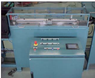
Cut-to-length feeder and control panel