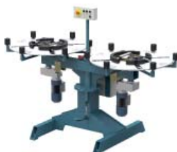
ALO 831 Double coiler