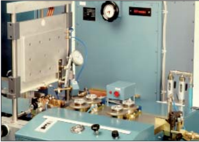
Tooth hardening generator