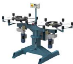
ALO 831 Double coiler