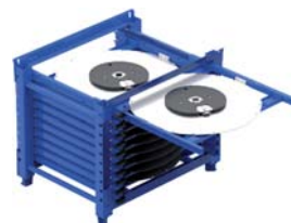
ALO 106 CUBE Coil handling system