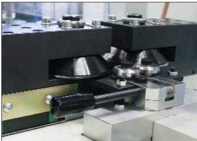
Pinch roller straightening unit