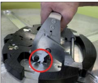
Safety coil center 90915-S: Releasing the hooks from the plate