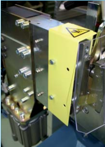
The new improved shear unit