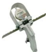
ALO 81-60 Set gauge