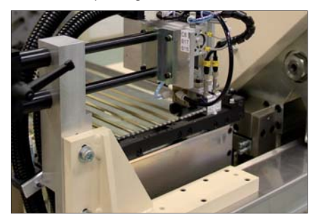
Outfeed magazine with pick and place unit.