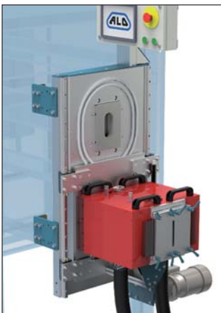
The work coils can be lowered out of the way to a service pos.