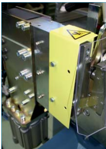
The new improved shear unit