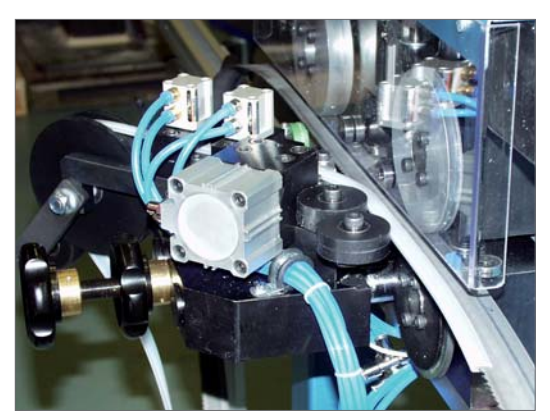
Band loop and plastic strip feeding units.