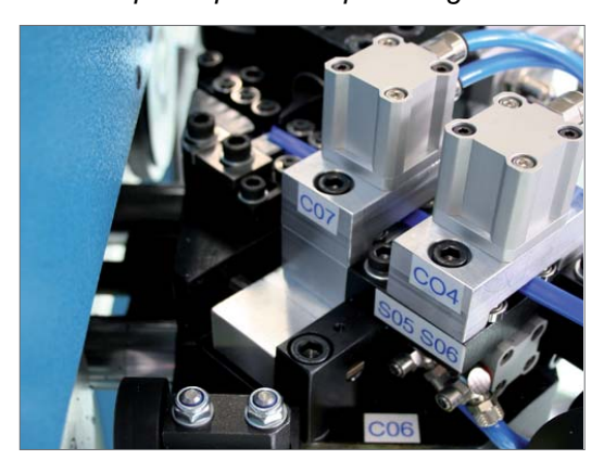
Shear and strip feeding unit.